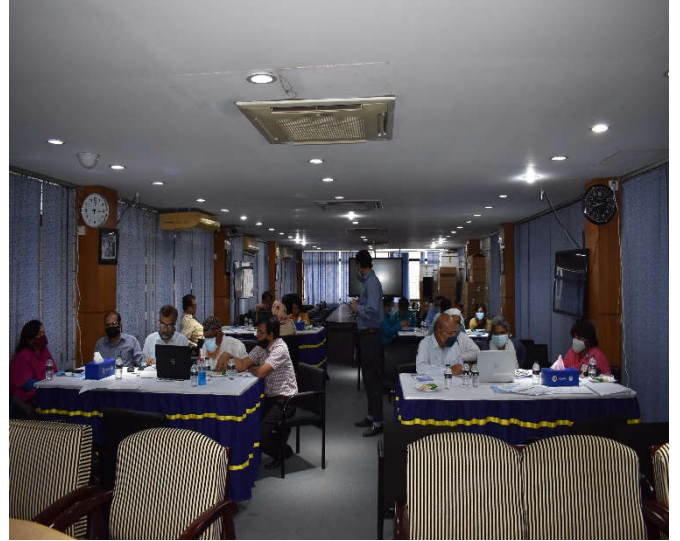
All Group work